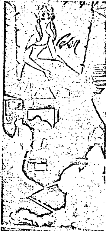
... lingerie at GUM...