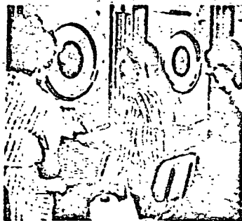
... and gossip at the Laundromat