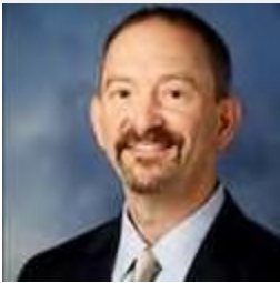
Chief Records Officer