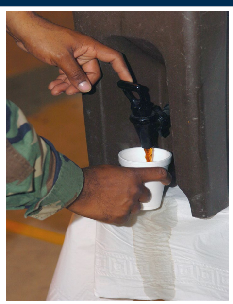
National Archives Identifier 6656626

archives.gov/ogis/foia-advisory-committee/2024-2026-term