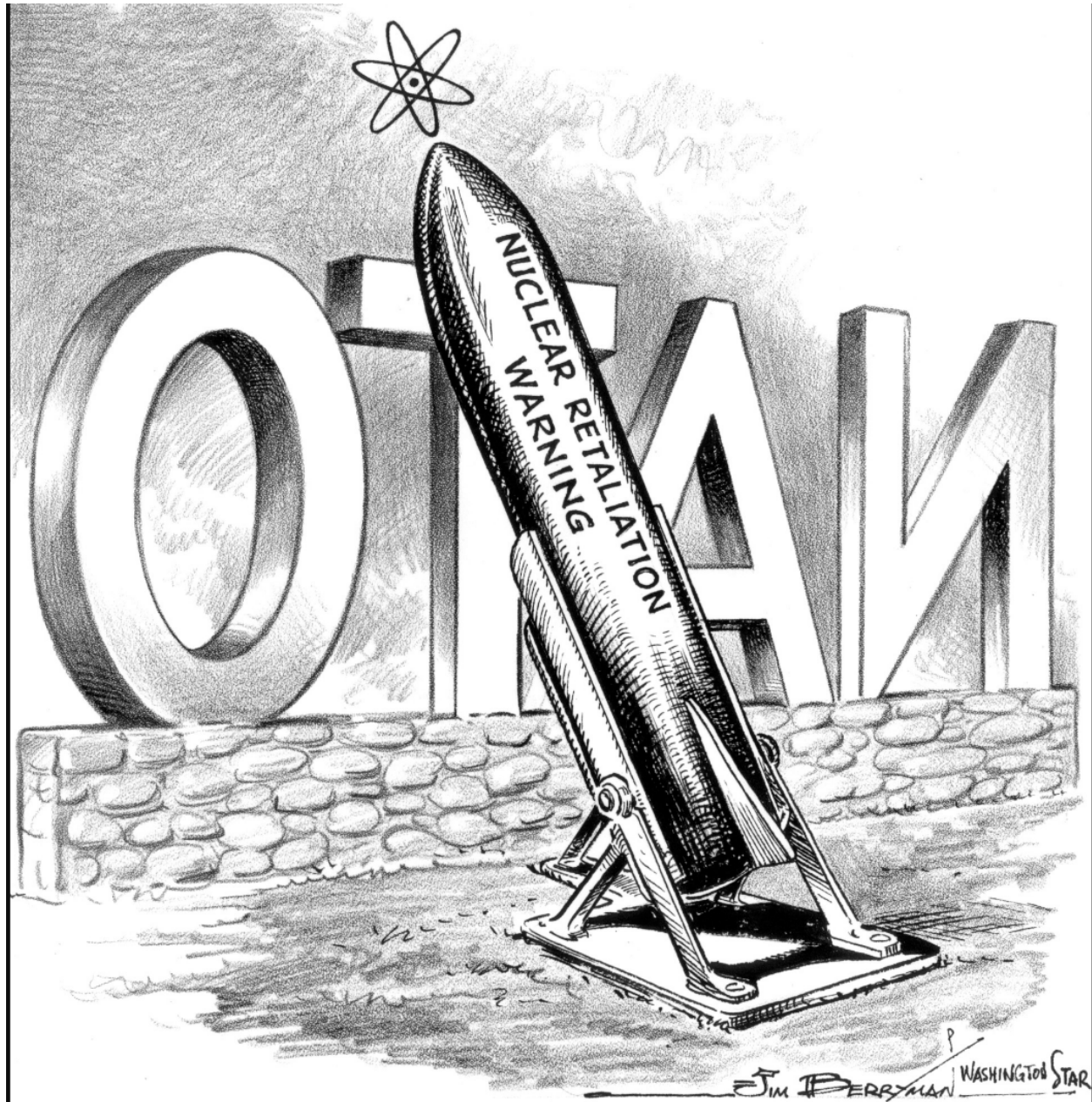
“Backing it Up.” Jim Berryman. The Evening Star, Washington, DC, May 6, 1957. Primary source preserved by: U.S. Senate Historical Office. NAID 5743241