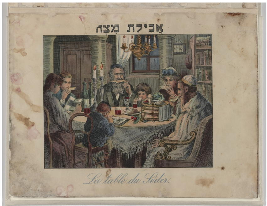
Above: Passover Haggadah from Vienna, 1930. This colorfully illustrated French and Hebrew Haggadah was published in Vienna. Caption on image: "Eating Matzah."

correspondence and publications illustrate the range and complexity of Iraqi Jewish life in the 19<sup>th</sup> and 20<sup>th</sup> centuries. Original documents and facsimiles in flipbooks range from school primers to international business correspondence from the Sassoon family.