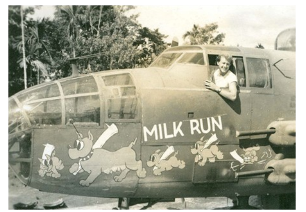
Above