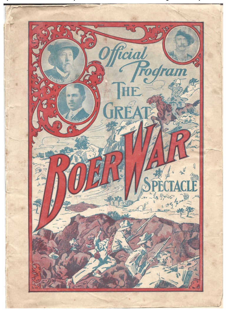
Above: Program cover from The Great Boer War Show.

The Olympic marathon featured two Black South African entrants, the continent's first indigenous Olympians. The pair pulled double duty. In addition to their long run they were in St. Louis as part of another exposition feature: The Boer