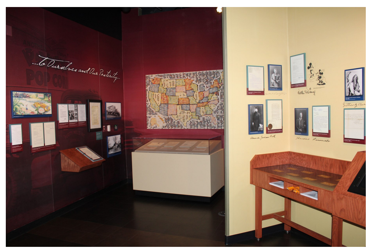
Above: Gallery photo of the section titled To Ourselves and Our Posterity.

• To Ourselves and our Posterity aims to illustrate that as the nation's record grows and changes, so does the National Archives. From rare parchments to electronic records, we preserve and make available to you the records that tell America's story. Materials highlighted in this section include a court case involving Walt Disney; National Park Service maps and images; a court case focused on The Harvey Girls movie script; and documents involving the prosecution of the Barker-Karpis gang.