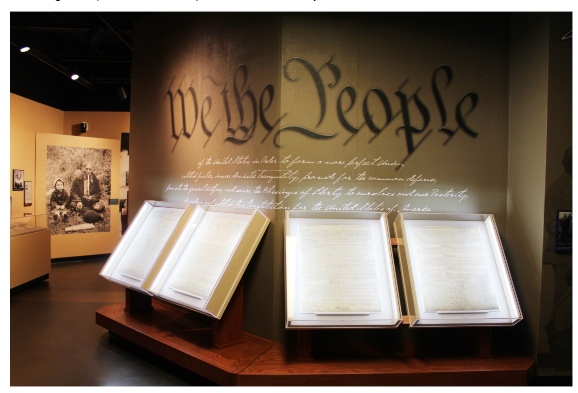
Above: Gallery photo of introductory section of We the People.

We the People introduces visitors to the process of becoming an American and reveals details about immigrants seeking citizenship in the United States. In addition, the exhibit features information about the first Americans (Native Americans) and family history research. Highlighted materials in this section include naturalization petitions; oaths of citizenship; enemy alien registration