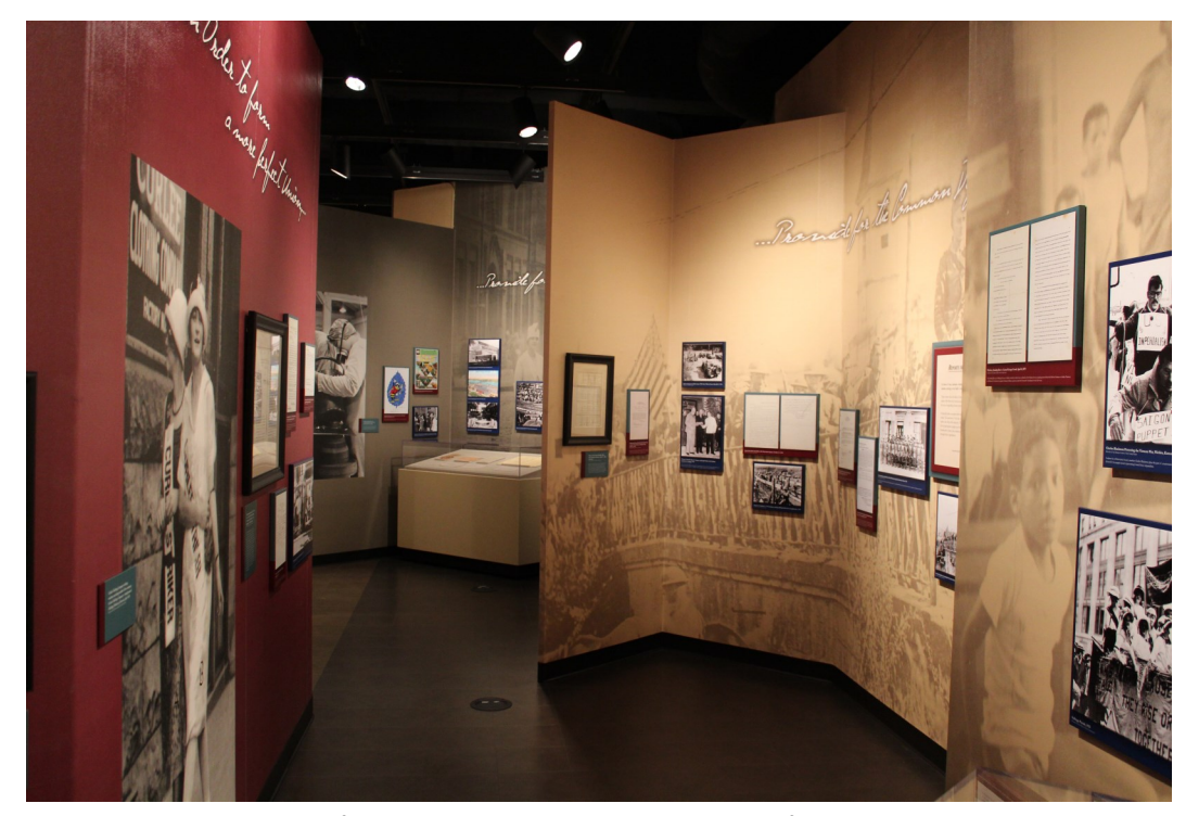
Above: Gallery photo of the section titled Form a More Perfect Union.

affidavits; photos from the Bureau of Indian Affairs schools; and a treaty between the Pawnee and Yankton Sioux.