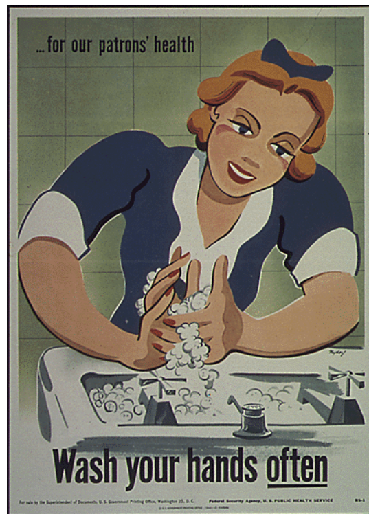
World War II Posters, 1942 - 1945 "Wash Your Hands Often".

Questions or comments? Email us at catalog@nara.gov .