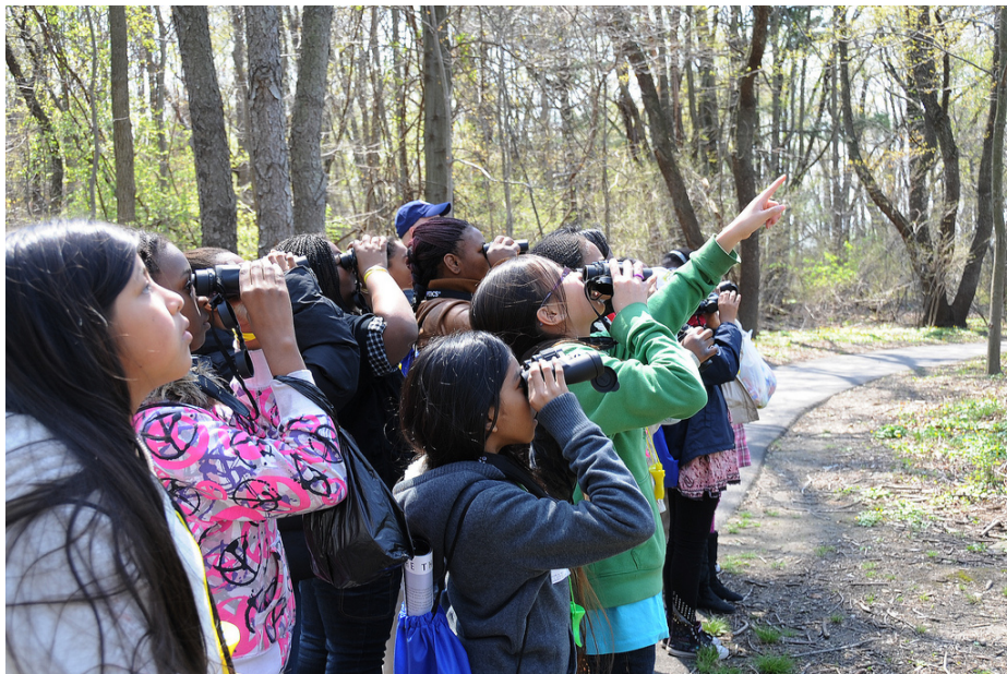
Students Birdwatching

With nearly 110 million digitized pages of records available (and thousands more added each week!), you are likely to find something new every time you search.